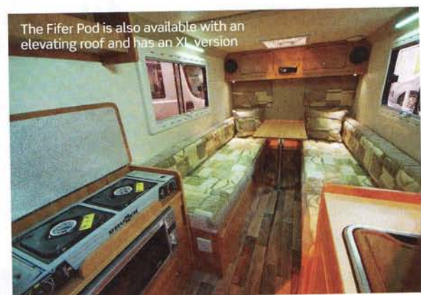
The Fifer Pod is also available with an elevating roof and has an XL version

The MOTORHOME & CARAVAN SHOW 11-16 OCT 2011 • NEC BIRMINGHAM