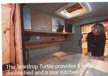
The Teardrop Turtle provides a wide double bed and a rear kitchen